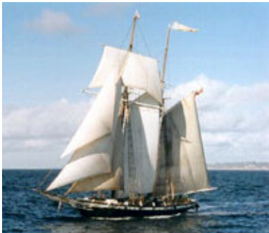
The Californian: California State Tall Ship

The Tall Ships Californian and Medea return to Chula Vista Harbor.